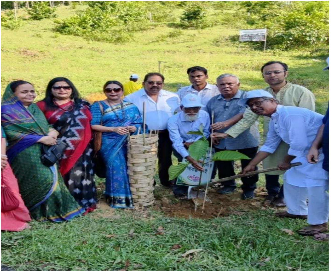
KFS also lead the massive tree planting effort for protection of Environment along with Omoraboti and other organizations.