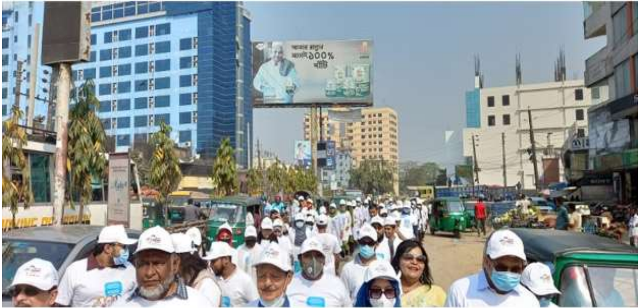
KFS team is always very active in creating awareness for prevention and support for kidney diseases