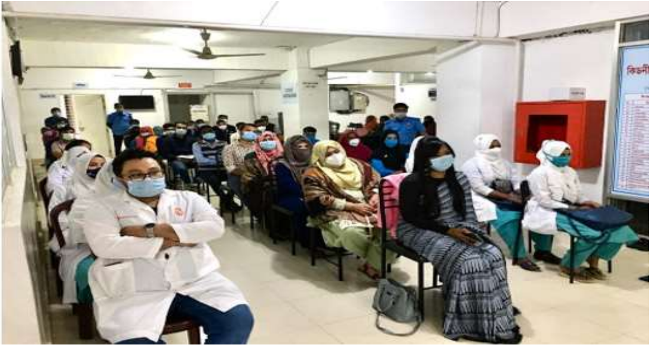
KFS provided training to physicians and nurses how to handle COVID patients and pandemic as much was known at that time.