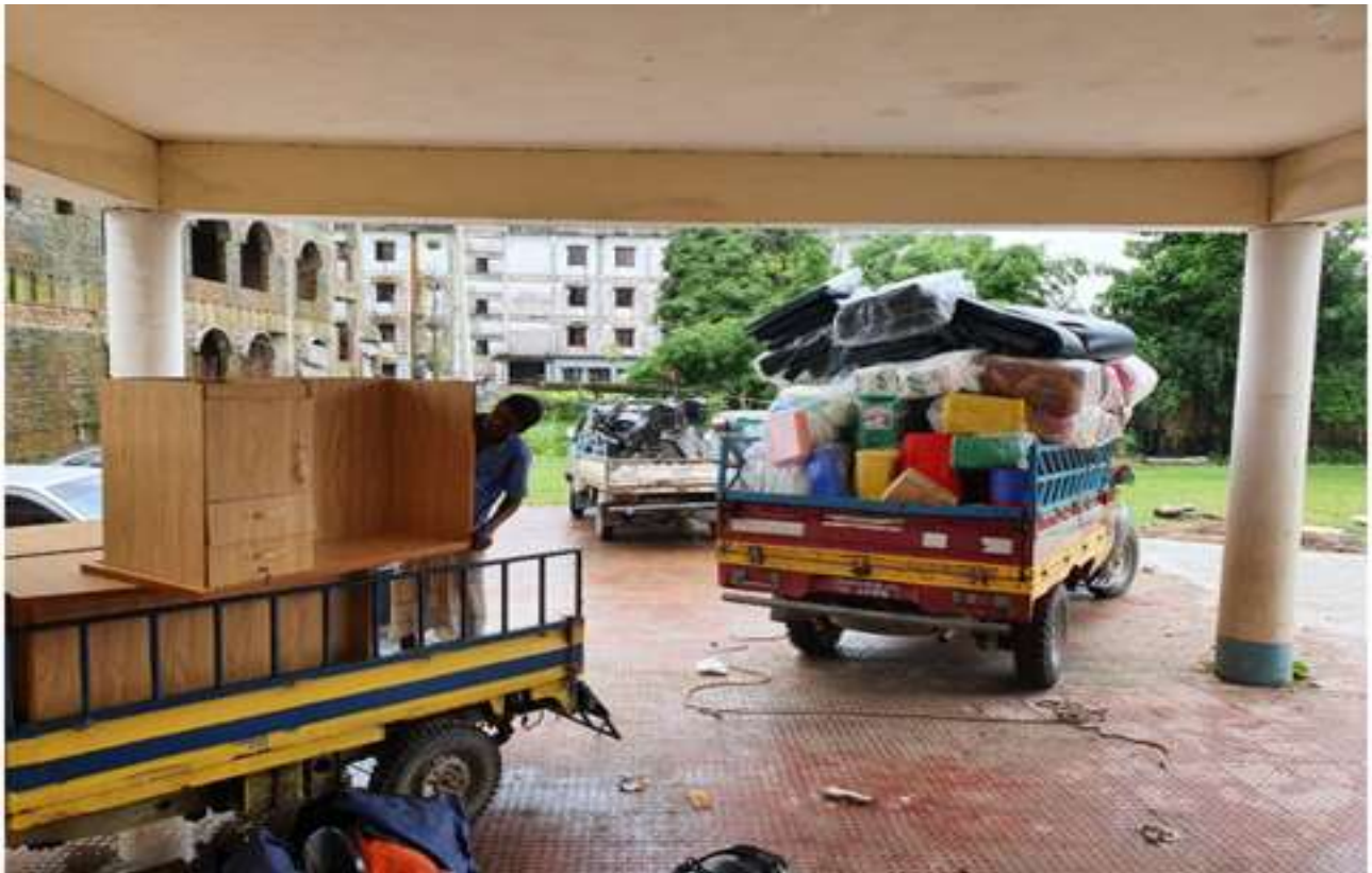
KFS received some support local concerned individuals and from the Diaspora groups from UK, USA and Canada.