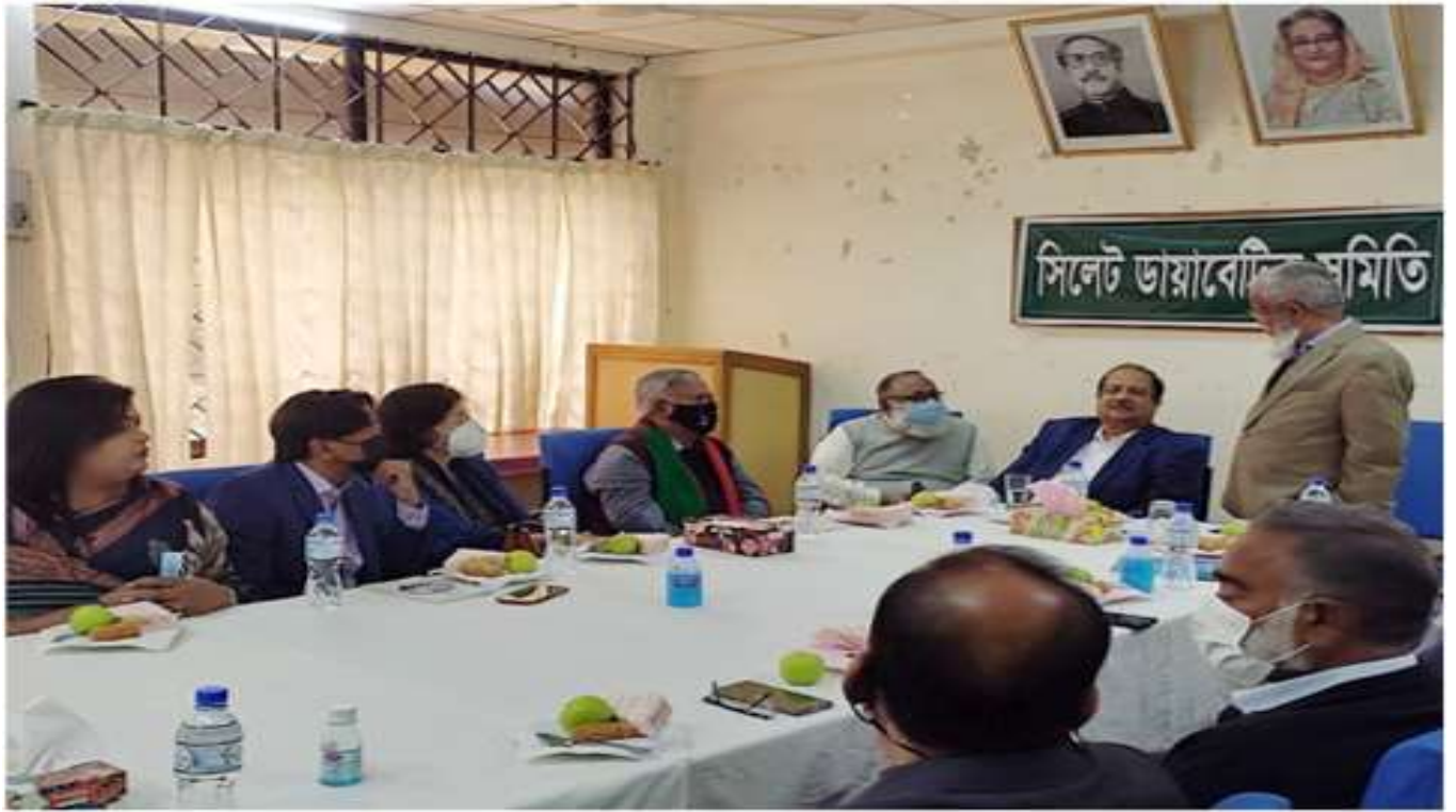
Sylhet Diabetic Hospital received a boost up from KFS