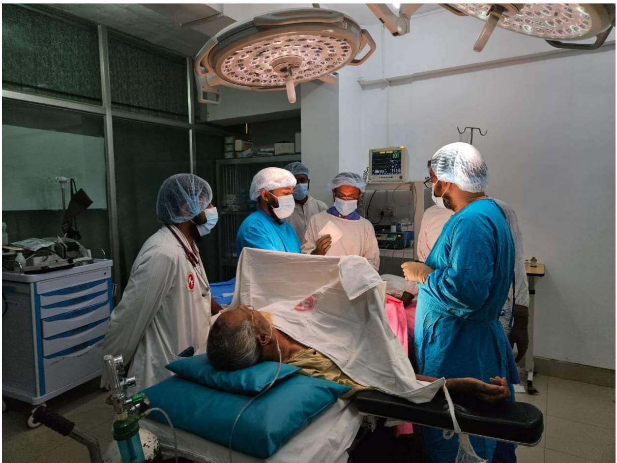
The center is providing surgical services to create dialysis fistula and placement of dialysis catheter, to all the patients in Sylhet area.