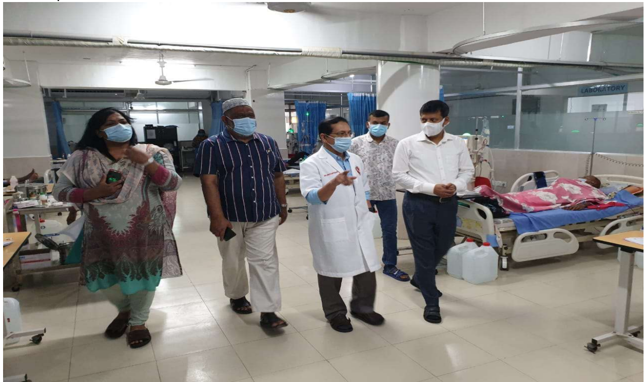
Deputy Commissioner Sylhet was visiting the center and was very appreciative of the standard of care.