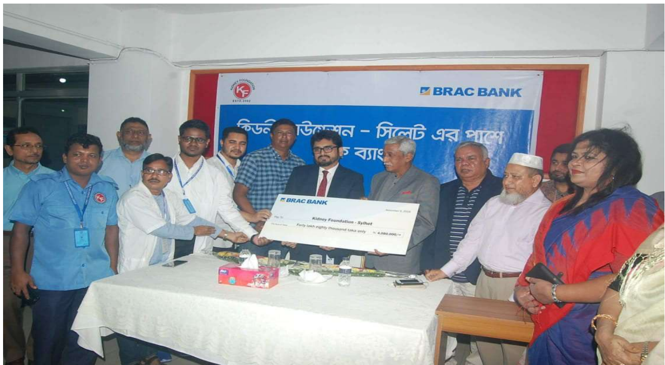
BRAC Bank giving a large donation