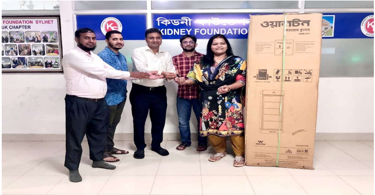
Donation of a dialysis machine

The center welcomes public participation to support the goal of the project by being member of the Foundation, giving generous donation for facility expenses, outreach program and most importantly sponsoring treatment of disadvantaged patient by donation or zakat fund etc.