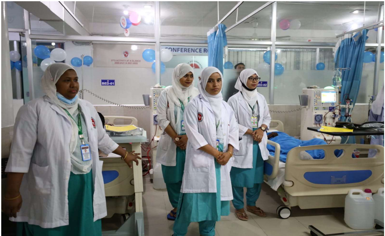
KFS also providing free 3 months training and stipends to dialysis nurses so they can get jobs and provide state of art dialysis treatment elsewhere