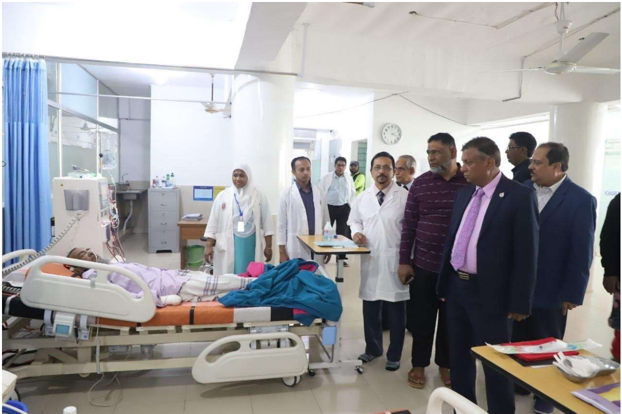
Ariful Haq , Mayor of Sylhet was visiting and was very grateful to see the support provided to the disadvantaged patients .