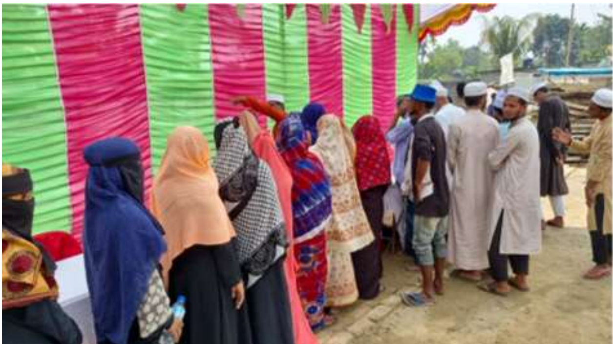
KFS been doing outreach services to the communities to identify high risk patients so we can prevent the progression to end stage kidney disease