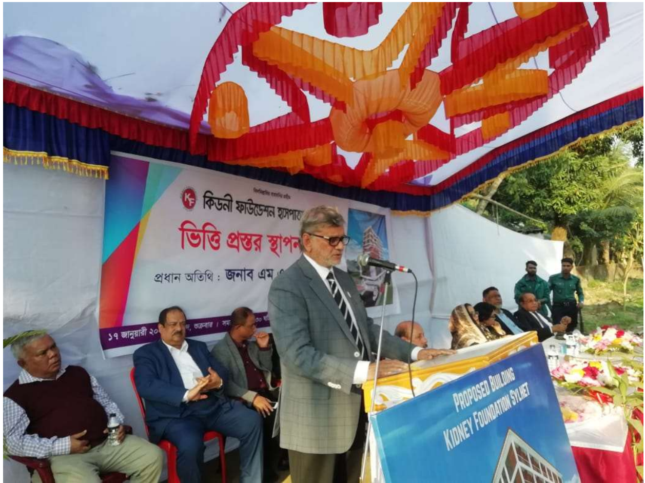
Ground Braking Ceremony was inaugurated by Mr. M A Mannan, MP and minister of Planning, Government of Bangladesh.