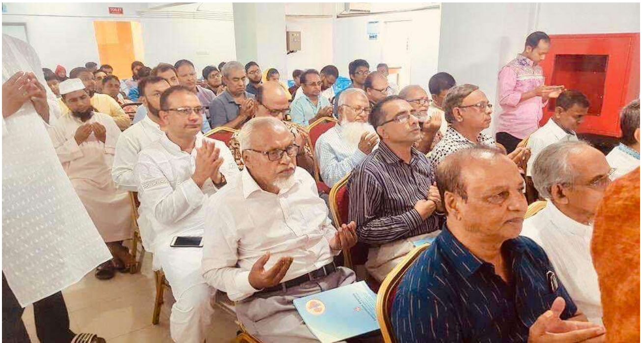
Prayer session by the gathering with high hope and expectation