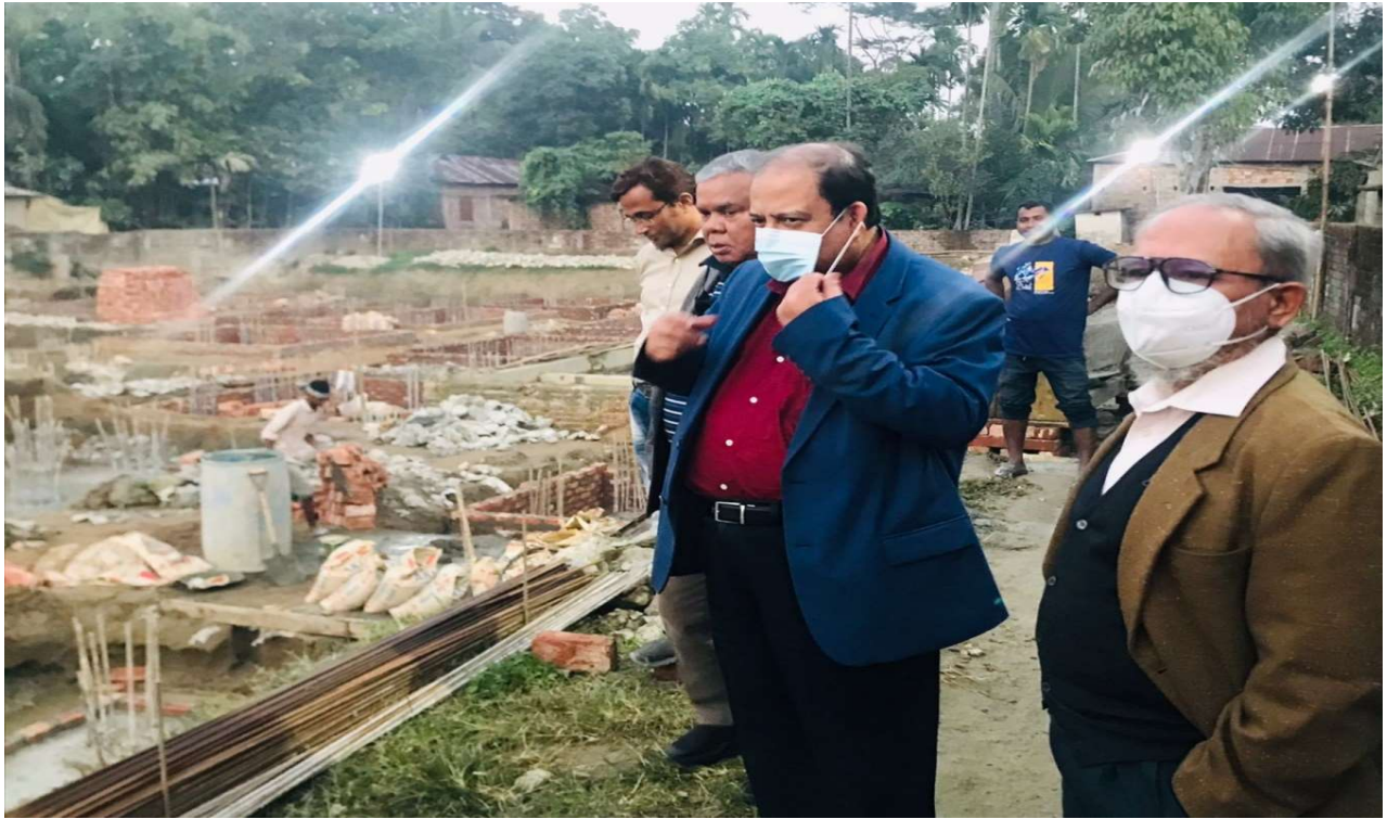
The main Hospital is a not profit project under PPP (Public Private Partnership) program for a 200 bed 10 stories Kidney and general hospital and research center.