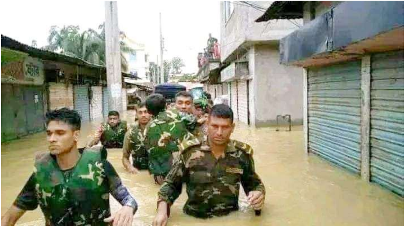
Bangladesh army supported the team with engine boats and logistic support which is a rare joint venture between public entity and Bangladesh military institution.