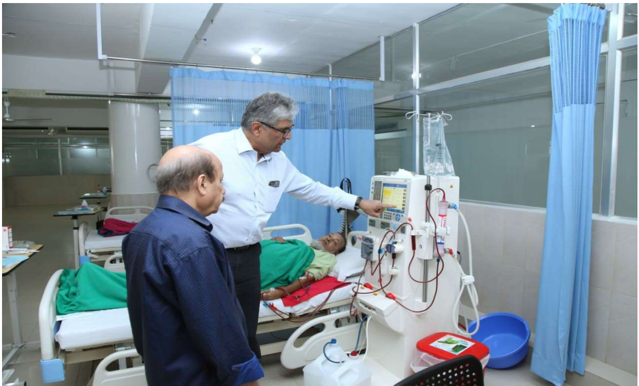
Visiting Professor from UK sharing his experience