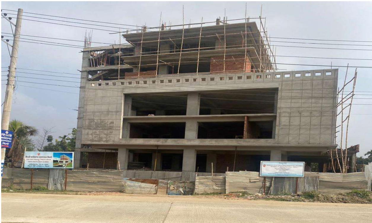
The Hospital has been under construction and is expected to start in early 2024